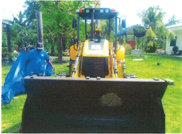
Front view of Backhoe

On June 28, 2017, the backhoe equipment was turned over to Kayangel State Government (Refer to Exhibit 2 below). The equipment was recorded into the State’s fixed asset system.