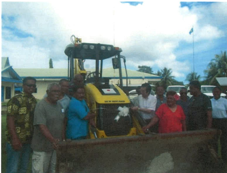
Turnover Ceremony with Japan Ambassador and Leadership of Kayangel State Government