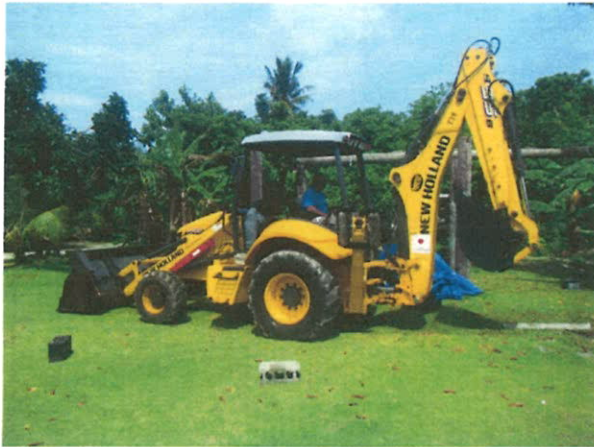
Side view of Backhoe now in Kayangel State